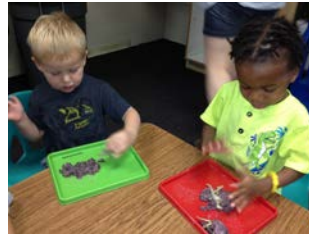
Making Dino eggs