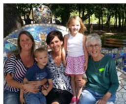
Great Time With Our Moms