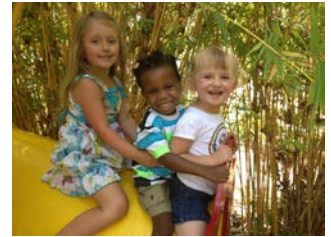
Field trip to the Gardens