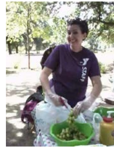
Lots Of Smiles