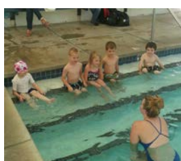
Fun In The Pool